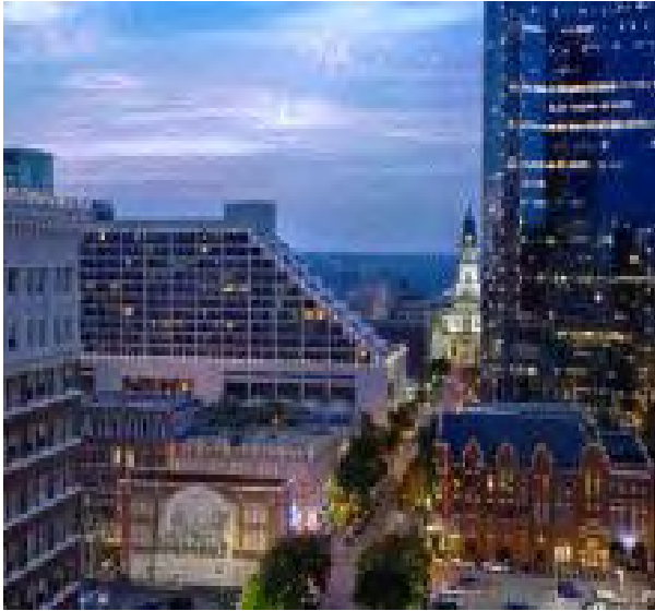
Renaissance Worthington Hotel, Fort Worth, Texas